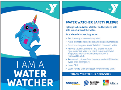
Annual Water Watcher Tags